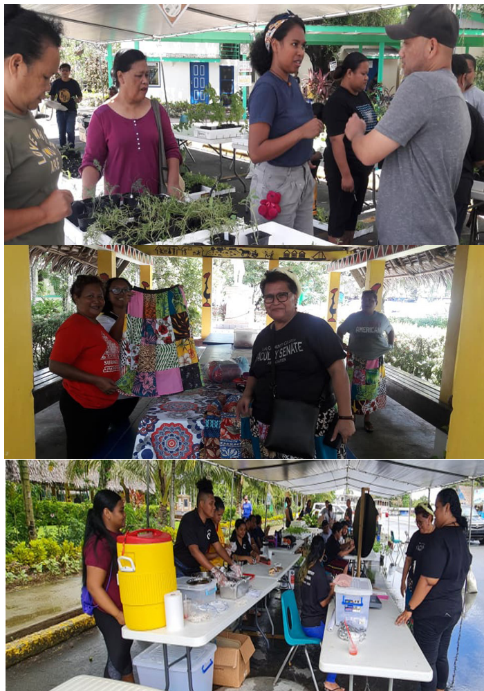
FSA Fundraising Event

On March 27-28, 2021 Palau Community College Faculty Senate Association (FSA) held a two-day fundraising event to raise funds for student scholarship program. On Saturday March 27 th , the FSA members from Automotive Mechanics Technology and CTE lab school students fundraised by changing automobile motor oil and car wash/vacuum cleaning. On Sunday, All members of FSA from Construction Technology, Agricultural Science, Information Technology, Small Engine & Outboard Motor, Tourism & Hospitality, and Palauan Studies programs fundraised at PCC Parking lot by selling various items from refurbished desktop computers, tables and benches, plants and vegetables, local food and drinks to garage sales at reasonable price. A free testing for blood pressure and glucose were also provided to the public by PCC Nursing program instructor and students. FSA Officers and members are thanked the college for their support and a successful fundraising event.