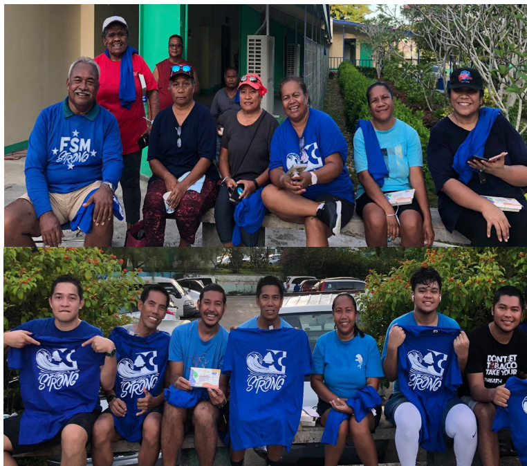
28 th Charter Day Presidents's Run & Walk Moments

On Wednesday, March 31, 2021 PCC marked the 28 th Charter Day of the College. In celebrating this event, PCC hosted the President's Run & Walk where it began at PCC Basketball court to Palau Cove Resort and back. Over two-hundred seventy runners and walkers joined the 5k run & walk event. With a substantial number of participants, the college charter day committee provided complimentary T-shirts to everyone who signed up. In addition, all participants were treated to a complimentary breakfast courtesy of PCC Cafeteria. The first 20 runners to reach the finishing line were