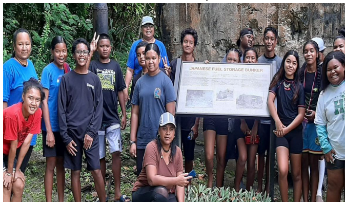
Airai Elementary School

On March 31 and April 3, 2021 Palau Community College Educational Talent Search (ETS) program conducted two field trips to Peleliu State.