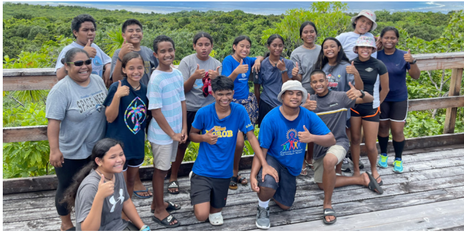
Maris Stella Elementary School