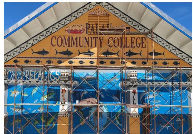
PCC Cafeteria Undersea Mural

Soon to be one of the amazing undersea world of pelagic mural on campus. The art wall beautifully depicts Palau's pelagic fish and turtle including our very own Mesekiu masgot featured in the center of the mural.