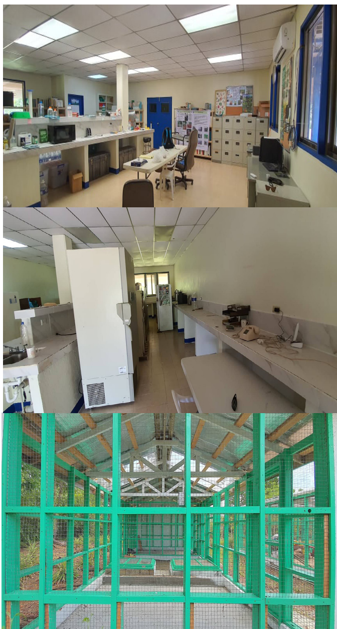
PCC CRE R&D Station Agriculture Laboratory renovated

The Palau Community College Cooperative and Research Extension - Research & Development station in Ngermes kang, Ngeremlengui State is under series of renovation phases to improve existing buildings.