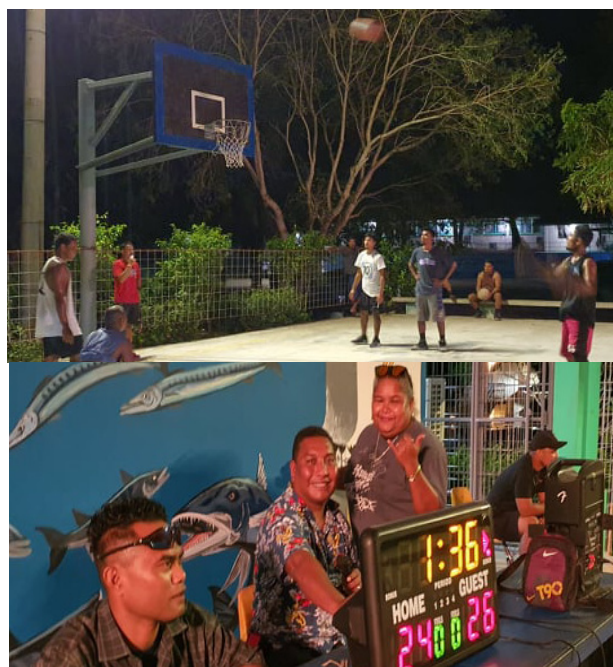
PCC Maintenance vs. Team ISO during best of three final

On April 21, 2021 PCC Recreation Office holds Intramural Basketball Tournament Finals. The best of three championship final will resume on Friday, April 23, 2021.