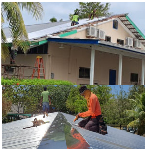
PCC Tekrar and Miich roofing repaired