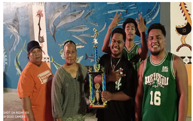
3rd Place Team ASPCC

On Friday, April 23, 2021 PCC Intramural Basketball Tournament held a championship game between Team ISO and Team Maintenance. The athleticism of Team ISO proved too much for Team Maintenance to overcome and quickly found themselves trailing most of the games and losing by a lopsided score of 79 to 49. The win earned Team ISO the championship trophy and Team Maintenance the 2 nd place and 3 rd place to ASPCC team.