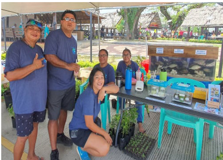
PCC CRE staff showcase aquaculture species, crops, and plants during Palau's Green Fair at Ernguul Park

On April 22, 2021 Palau Community College Cooperative Research and Extension (CRE) staff participated in Palau's Green Fair at Ernguul Park to showcase aquaculture marine species such as rabbitfish and mangrove crab seed production and spawning. CRE aquaculture program also display research information on various coastal marine species and community outreach programs to support local fish farmers.