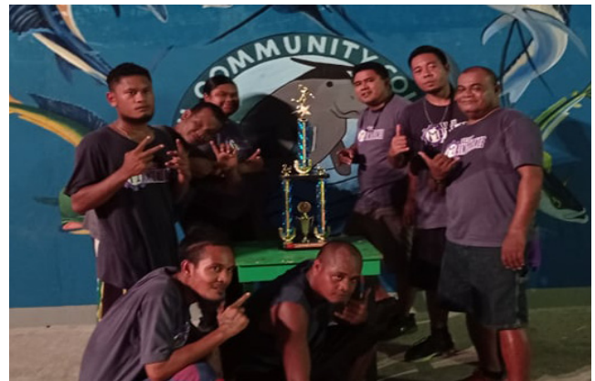
2nd Place Team Maintenance