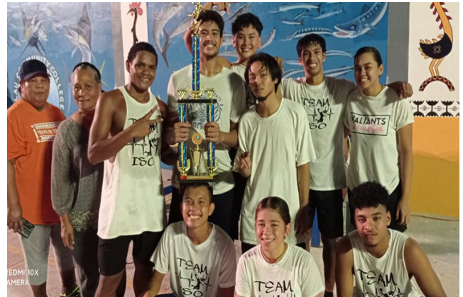
1st Place Team ISO