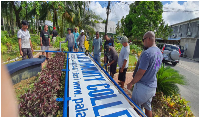
PCC Maintenance in preparation to raise the college signage