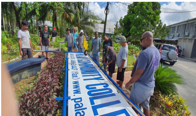
PCC Maintenance in preparation to raise the college signage