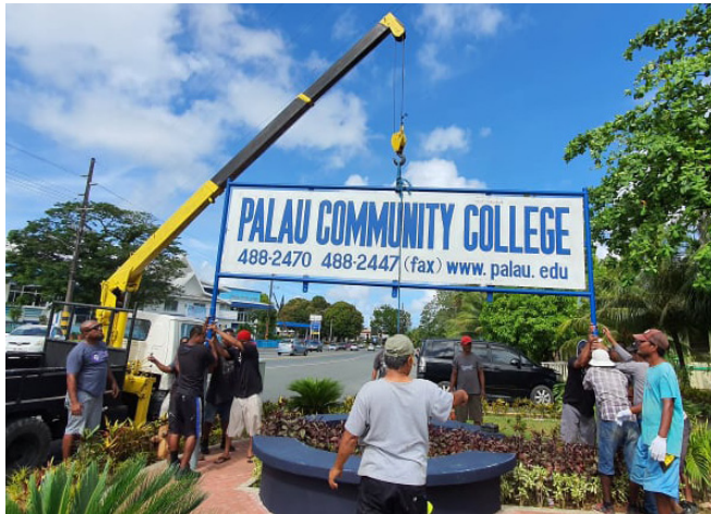
Utilizing crane truck to finally raised PCC signage

On May 4, 2021 PCC Maintenance finally restored college front signage that was battered from Typhoon Surigae on April 16, 2021. The restored signage resembles the original one with materials that are more durable. The college signage installed just in time for the college upcoming commencement exercises on May 14, 2021.