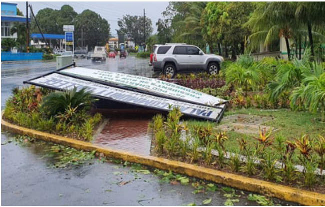
PCC front signage after Typhoon Surigae on April 16, 2021