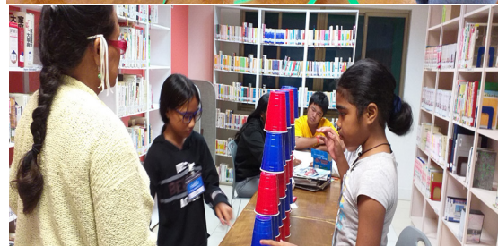
PCC Library Summer Kids program activities