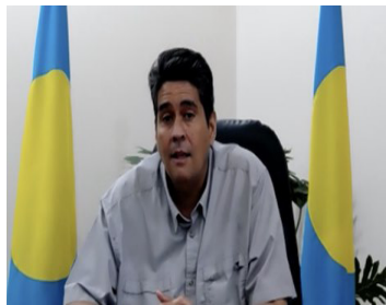
President Surangel Whipps, Jr. Republic of Palau