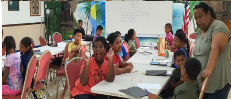
Students in 3 rd and 5 th grades math and english class

The Palau Community College Continuing Education launched its 2021 Summer Kids Program with academic subject in Singapore Math, English Reading & Writing, Palauan Orthography, Marine Science, Art, and Music for elementary school students from 3 rd to 8 th grades. Students will also participating in cultural and educational activities during the four weeks of learning and interaction with peers. There are over 170 students from various schools in Palau attending this year's summer kids program. Continuing Education is working with teachers from local public schools to make this summer program more engaging and educational. Program teachers are Lady Ngiratkakl, Delina Kebekol, Emadech Oiterong, Kayleen Joseph, Stephanie Adelbai, Yvonne Ruluked, Eric Reklai, Fabio Siksei, Howard Charles, and Emily Kaleb. PCC Continuing Education also extends its gratitude to the following intern and work-study students