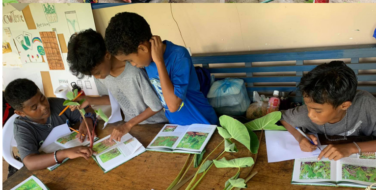
Students learning various taro seedlings and propagation methods

This week, Palau Community College Cooperative Research & Extension (CRE) Research & Development Station and Multi-Species Hatchery in Ngeremlengui are hosting summer camp students from SERS-ED program.