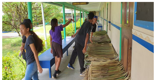
CTE students transfer weaved nipa leaves ready for roofing