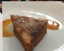
Fine Dining: a three course-meal