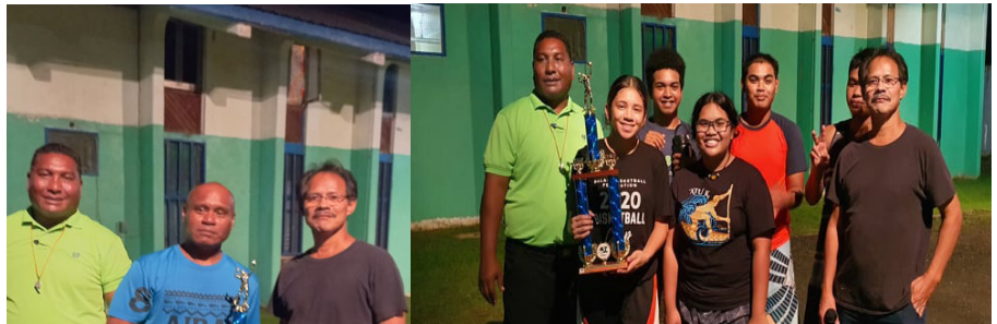
1 st Place Team Second Serve