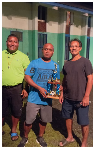
3 rd Place Team Kebsesengei