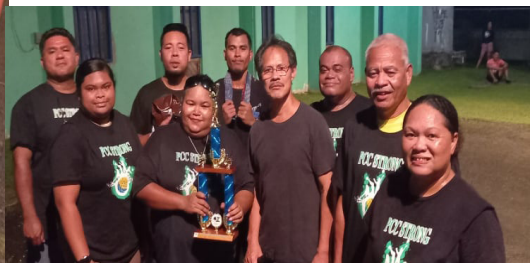
2 nd Place Team PCC Strong