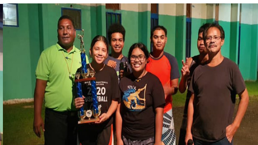
1 st Place Team Second Serve