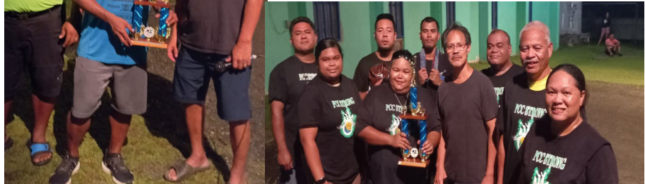
2 nd Place Team PCC Strong