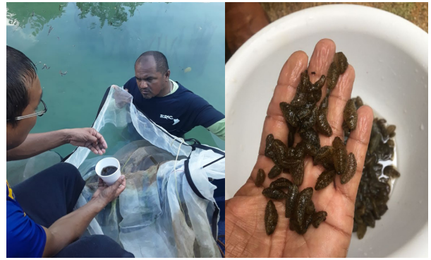
Sand Fish Sea Cucumber delivered to grow-out cage farm in Melekeok State

PCC-CRE Multi-Species Hatchery Supports Local Sea Cucumber Aquaculture Farm