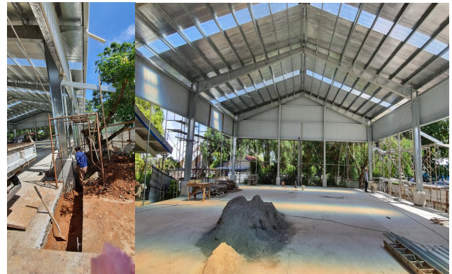
The construction of a new covered PCC Basketball Court is soon to be completed.