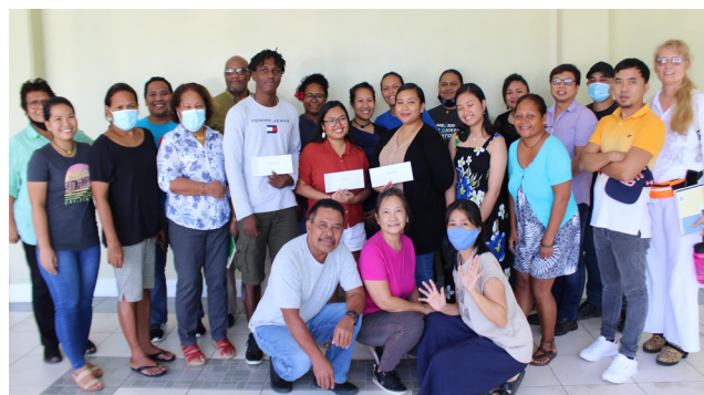
PCC FSA members with FSA Scholarship Recipients

On Friday, October 22, 2021 Palau Community College Faculty Senate Association awarded scholarships to four PCC students.