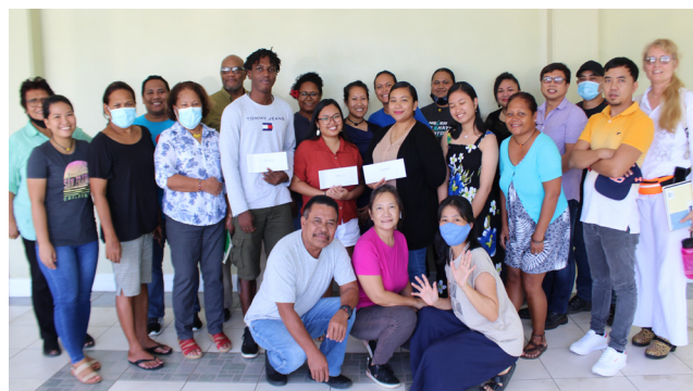
PCC FSA members with FSA Scholarship Recipients

On Friday, October 22, 2021 Palau Community College Faculty Senate Association awarded scholarships to four PCC students.