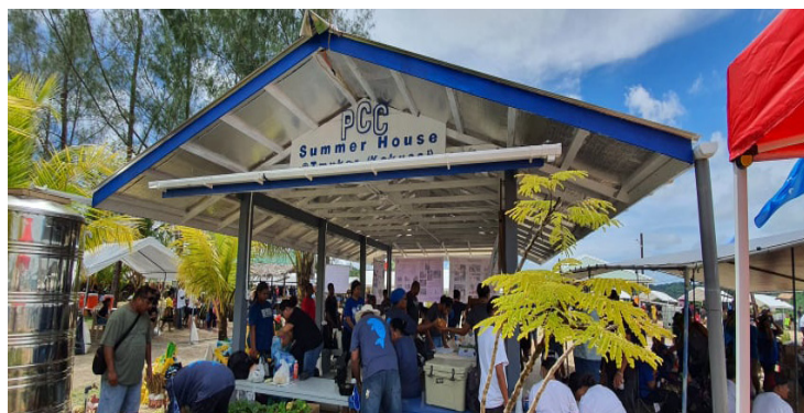
Newly built PCC Summer House with CRE display tables at 2021 OBF/ UN-Day celebration at Kokusai, Ngatpang State

On Sunday, October 24, 2021, Palau Community College participated in the 2021 Olechotel Belau Fair (OBF) & United Nations Day with a theme “ A Klai-urenges a Didellel a Mesisiich el Kelulau ” ( Building Resilience Through Hope ) at its newest summer house located at Kokusai, Ngatpang State. PCC Cooperative Research & Extension display tables showcased live rabbitfish and other marine species currently in the Multi-Species Hatchery. Provided information on various local root crops, fruit tree plants, and vegetable gardening plants. Visitors signed up for a free giveaway fruit tree and taro plants. CRE also provided information on different types of table top gardening methods, tissue culture plants, pest management, and germplasm conservation. PCC President Patrick U. Tellei and CRE Director Lyndon Masami were present to assist CRE staff while tending to visitors. Also present to fundraise their local style barbecue plates were Federated States of Micronesia (FSM) Yap Students, PCC Environment/Marine Science Club and Kosrae State Association. The OBF activities included opening ceremony, parade of Nations, live band, traditional and contemporary dances and traditional games. All 16 States took part in this event by showcasing their various local delicacies, arts and crafts.