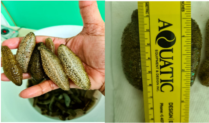
Juvenile Sandfish prepared to be released in the water