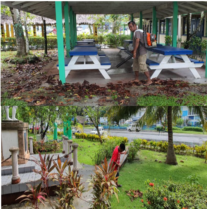
Maintenance staff busy cleaning up debris from Tropical Storm Rai