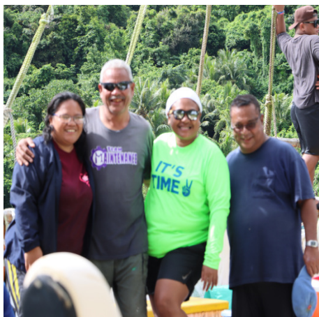
PCC staff during a star-gazing excursion to Koror State Southern Lagoon