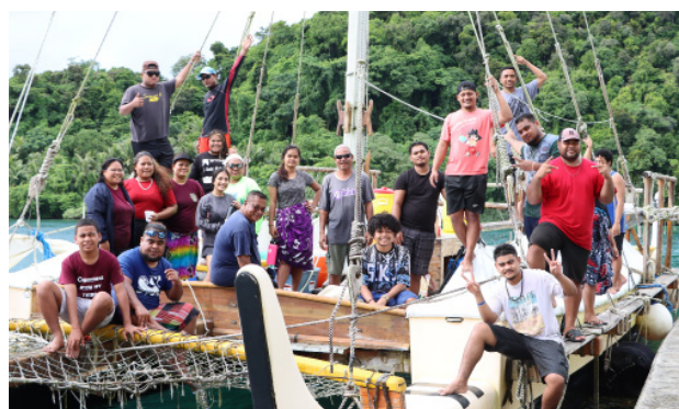
Dorm students aboard Alingano Maisu

On January 04, 2022 Palau Community College dorm students and student life staff participated in an overnight star-gazing aboard Alingano Maisu.