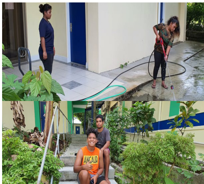
CTE Students cleaning upper campus

PCC extends gratitude and appreciation to our CTE Lab School students who took days during christmas break to pressure wash our upper campus. A big Thank You to All!