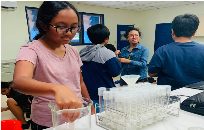
Students hands-on experiment at CRE Research & Development Station