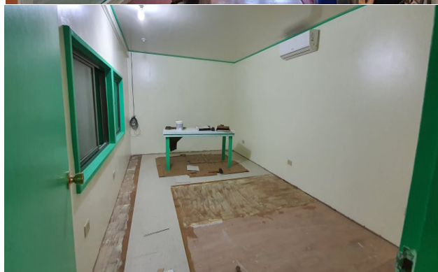
Top photo: cooking area; bottom photo: control room

Palau Community College Cafeteria is currently undergoing renovation. Old formica walls are being replaced with cement boards. New electrical switch box and double wall box are being installed. Walls are being painted with the college official colors. The second floor control room has been renovated by replacing wall and ceiling panels, installation of new wooden floors and vinyl tiles. Indoor stairway treads and risers are being repaired and repainted. The renovation work is part of the Our Ocean 2022 conference initiatives to improve and restore structural buildings to be used by the event.