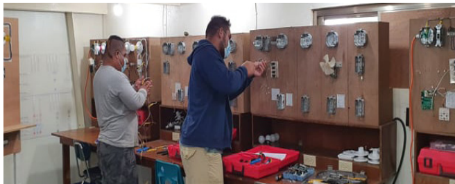
Electrical Technology students

This week, PCC Academic Affairs has began the traditional face-to-face learning with 85 courses with the least enrollment.