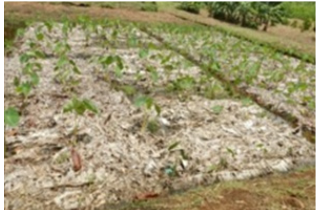
Upland Taro at CRE Research & Development Station in Ngeremlengui State

from soil erosion and furthermore can be repeated throughout multiple sites to increase production. Considered the increased yield and reducing soil erosion, the article recommends best practices by applying minimum tillage using a handy auger with betel nut leaf mulch for planting upland taro. Palau root crops are major staple food for the people and vital to the food security as well as customary purposes. For more information on the published journal article, visit https://www.jstage.jst.go.jp/browse/ jsta/65/2/ contents/-char/en