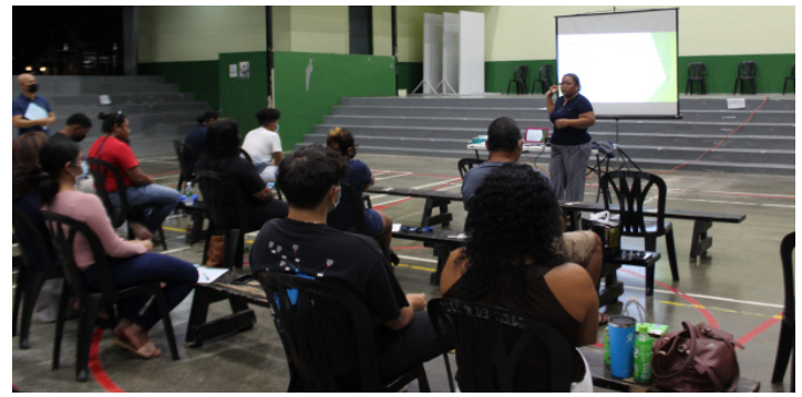
On March 10, 2022 PCC Financial Aid office held a financial aid session for seniors of Palau Mission Academy and their parents at SDA gymnasium.