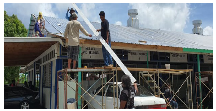
PCC CTE students assisting installing new aluminum roof at Tekuu Bldg. including insulation to reduce heat and conserve energy.

CTE Lab School Students Assist in Roof Replacement of Tekuu Building