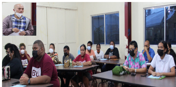
FAO Continued on p. 2

Palau Community College is an accessible comprehensive public educational institution helping to meet the technical, academic, cultural, social, and economic needs of students and communities by promoting learning opportunities and developing personal excellence.