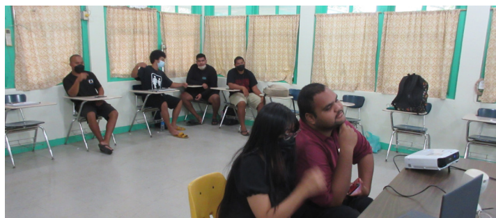
PCC JP 119 students