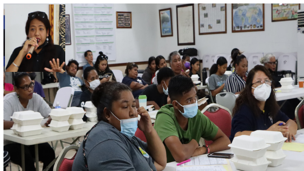
Inset: PNSB representative during ETS Seniors & Parental Workshop in Assembly Hall

On April 28, 2022 Palau Community College Educational Talent Search conducted a two-hour Seniors & Parental Workshop at PCC Assembly Hall.