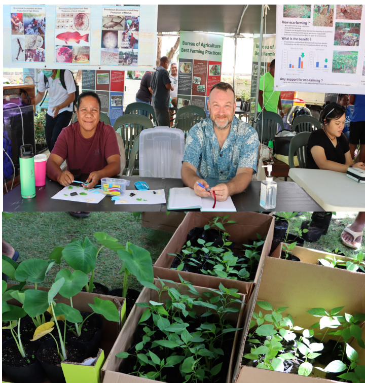
PCC CRE staff during Earth Day - Green Fair 2022

On Friday, April 22, 2022 Palau Community College Cooperative Research & Extension participated in the Earth's Day Green Fair at Long Island Park. Also participated were Bureau of Agriculture-Ministry of Agriculture, Fisheries, and the Environment (MAFE) staff and various Non Government Organizations (NGO's).