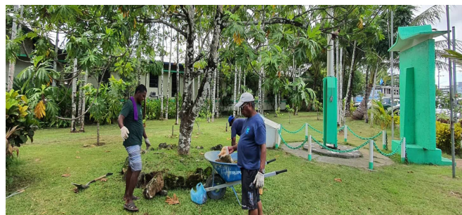
PCC Cooperative Research & Extension staff making a mulch ring on the breadfruit tree with compost and soil to help feeder roots.

On July 6, 2022 Palau Community College Financial Aid office conducted sessions for students enrolled in the summer on eligibility requirements and recent increase on Free Application for Federal Student Aid (FAFSA).