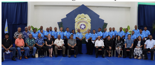
Elected leaders & honor guests with the academy cadets