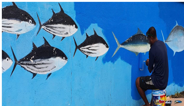
PCC Maintenance staff repainting pelagic fish mural facing National Track & Field parking lot