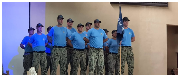
Civic Action Team 133-30