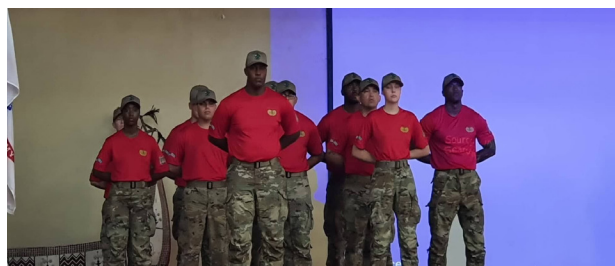
Civic Action Team 84-08

On Monday, August 01 2022, Palau Community College Executive Assistant to the President and Director of Development attended a Civic Action Team (CAT) Change of Charge Ceremony at Chamayong Cultural Center.