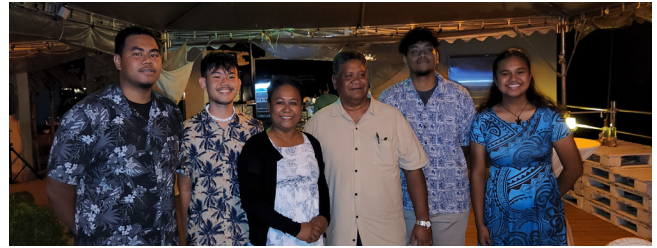
PCC students with Minister of State Gustav Aitaro during dinner reception at PRR

The ship serves as both a floating university and sail training vessel bringing students, scientists, voyaging crew, and professionals together on different leg of the journey. The 107 year old grand ship has been converted into a state-of-the-art research vessel that collects high quality data throughout its journey. Equipped with modern instruments that measures levels of CO 2 , micro-plastic, ocean acidification, biodiversity, and ocean temperature. With its quiet movement sailing in the water, it can collect acoustic data from the upper ocean in both passive listening and active echo sounders. PCC is grateful to have EMS and IT students take part of this lifetime adventure that was made possible through the leadership of Minister Gustav Aitaro who orchestrated commitments and fundings from Norway, Japan, and Palau government.