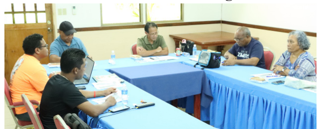
9/11 committee is in the process of preparing, planning, and implementing the upcoming 21 st memorial service to be held at PCC Assembly Hall on September 12, 2022 @ 6 p.m.