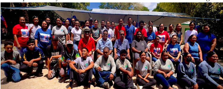
U.S. Constitution Day celebration with guest speaker former ROP President Johnson Toribiong and students at PCC Library compound