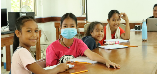
PCC CE Intersession Program students and teachers at Ibokill and training room

On September 26, 2022 PCC Continuing Education launched an Intersession Program with two classes in English Reading & Writing and Palauan Orthography from 8 a.m. to 11:30 a.m. and three classes on Singapore Math, Marine Science, and Basic Art in the afternoon for public elementary school students. Classes are designed to help the students enhance their abilities and improve their skills in the subject area. Students are also given the opportunity to foster new skills and interests. The Intersession Program is based on the Palau Ministry of Education's plan to implement year-round school year calendar with recurring classes.