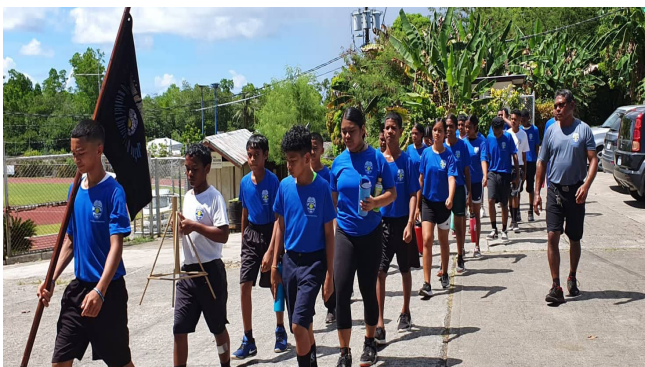
The first Intersession Boot Camp for public school students took place on PCC Campus from September 19-23, 2022. The program is to encourage positive behaviors and foster good compadre among the students participating in sporting events and safety drill.