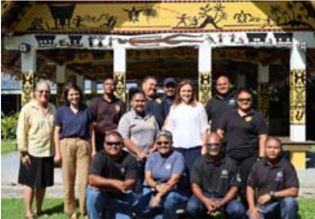
Facilitators and participants during a three-day training at PCC library conference room

On October 18-20, 2022, Palau Community College hosts a regional training sponsored by European Union, Basel/Rotterdam/Stockholm (BRS) & Secretariat of the Pacific Regional Environment Programme (SPREP) at the college library conference room. About ten (10) local enforcement officers and EQPB staff participated in this three-day training to strengthen the capacity related to national legal & institutional frameworks, enforcement, prevention, and combatting of illegal traffic and trade in hazardous chemicals and wastes materials according to BRS convention.