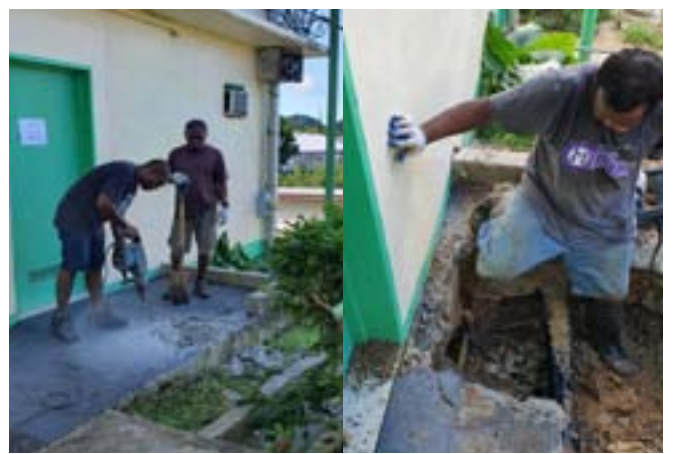
On November 07, 2022 The college maintenance staff identified a leaking water pipe at Ksid building. Work immediately follows to repair and restore much needed water supply to all restrooms in the building. Thank you Maintenance staff!