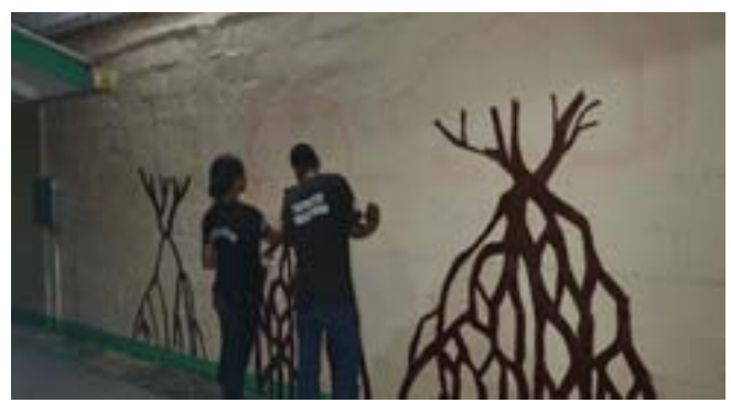
PCC CTE Lab School students repainting the Continuing Education training room exterior wall depicting Palau's marine coastline mangrove plants which stabilize soil, coastal protection and serves as marine habitat.