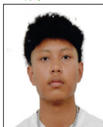
Justin I. Orville David Shipper Memorial Scholarship