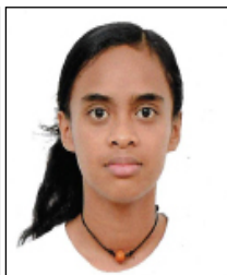
Ember E. Fukuichi Sandra S. Pierantozzi Scholarship