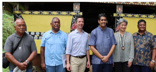
Ulengchong Scott Yano, PCC President Dr. Tellei, Australian Senator Hon. Simon Birmingham, ROP President Surangel Whipps, Jr., Australia Minister for Foreign Affairs Penny Wong, and ROP Minister of State Gustav Aitaro

On December 15, 2022 PCC President Patrick U. Tellei mediates information about the traditional Bai at Belau National Museum used by Palauan Council of Chiefs for meetings, feasts, trials, disaster preparedness, war strategy sessions, and mourning to Australia Minister for Foreign Affairs Penny Wong and her colleague Australian Senator the Honorable Simon Birmingham. Also present during press conference were Palau local newspaper representatives from Tia Belau, Island Times, and Australian associated press.