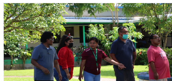
Dean of CE and UBMS Staff