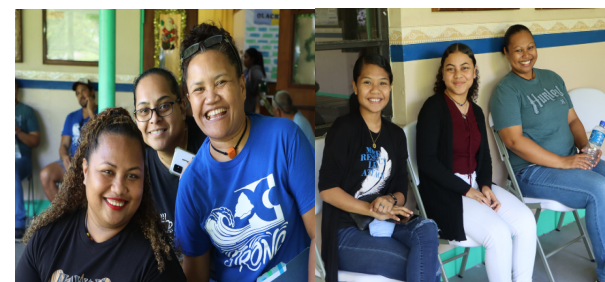
ETS, HR, & Finance staff