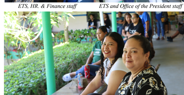
Business Office staff

On December 22, 2022, Palau Community College hosted an Annual Christmas Luncheon to all faculty, staff, and students at Mesekiu Bai.