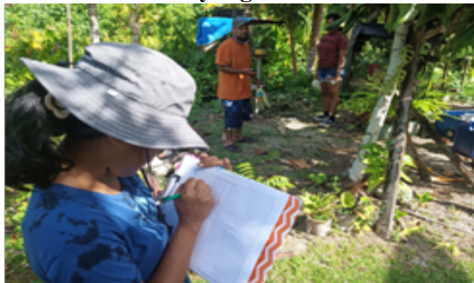
Household fruit tree survey and fruit fly trap deployment

On December 14-16, 2022 PCC-CRE conducted pilot project in Kayangel State on fruit fly. CRE staff and PCC students stayed at the island, their main activities were surveying fruit trees and testing out a fruit fly trap design in partnership with Kayangel State residents. “CRE is collecting GPS data to develop a fruit tree map of the island, deploying a simple fruit fly trap design that is being produced at PCC’s 3D maker space, and attending community meetings and visiting households to discuss fruit fly trapping and green waste management” said CRE’s Vice President, Dr. Christopher Kitalong. CRE extension agents also provided advice on identifying and managing breeding areas around and nearby households, collecting and processing green waste to prevent further breeding, and placing fruit fly traps to maximize catch.