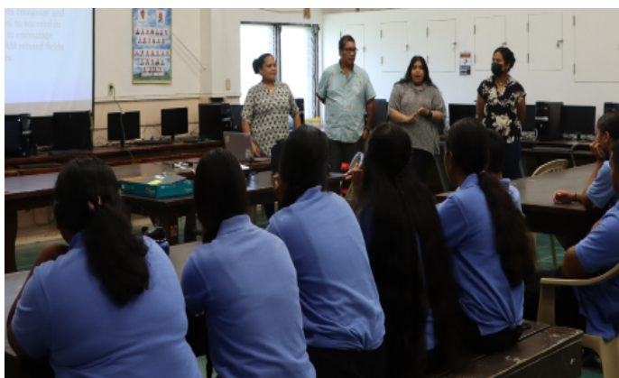
UBMS staff during a presentation at PHS Resource Center