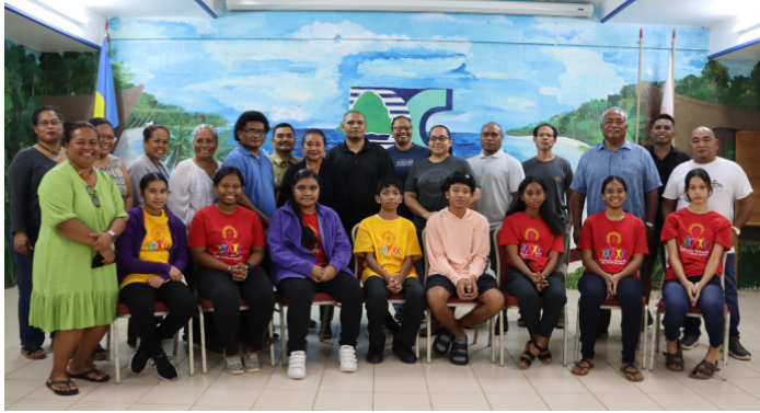
PCC Ex-Com members with Mindszenty High School students during a luncheon at PCC Assembly Hall

On January 31, 2023 Eight students from Mindszenty High School participated in a Job Shadowing program hosted by Palau Community College and its respective divisions and offices. As part of Mindszenty High School Catholic Week activities, students participated in the half-day hands-on learning of tasks, services, and programs provided on a daily basis to support students learning. Luncheon was provided to welcome MHS students and introduced the college Ex-Com members who oversee various divisions and offices of PCC.