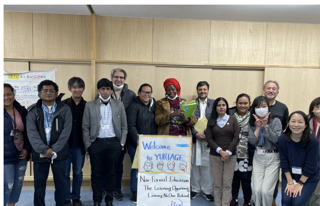
NFE participants during the opening session in Japan

PCC Dean of Continuing Education attended Non-formal Education (NFE) program in Japan which aims to share and discuss theories, practices, and challenges of (NFE) by utilizing knowledge and experiences of program participants and cases made available in Asia, including Japan. NFE is defined as 'institutionalized, intentional, and planned by an education provider. It's an additional, alternative, and/or complement to formal education, with both official and non-official qualifications', according to the International Standard Classification of Education of UNESCO Institute of Statistics (UIS, 2011). In many countries, NFE covers the following areas: