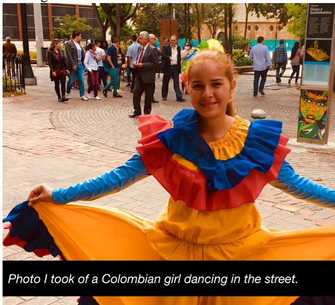
Photo I took of a Colombian girl dancing in the street.

I took a bunch of photos and asked a lot of questions. Upon diving deeper into the country's history, I realized that the artwork I saw around the city told the same story, although in different ways. The art told a story of a people who have suffered immensely but are equally proud of their history and culture. Many of the artwork served as scars of collective trauma and healing.