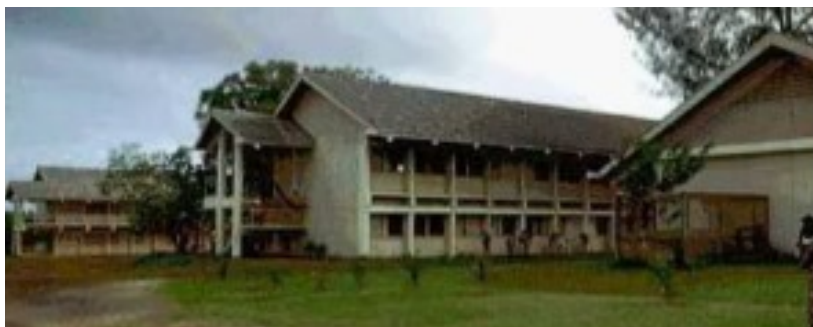
Micronesia Occupational College Dormitories

To do this task, we must not only tell the youth what they need to hear, but rather model good citizenship. Our youth today are bombarded by information 24/7 and are a lot more connected to youth around the world than me and my friends back in the early 2000s. They are truly global and digital citizens with unprecedented challenges to navigate and new risks to mitigate.