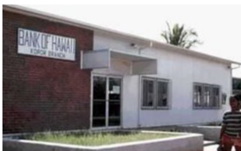
Bank of Hawaii Koror Branch, 1976

(Source: The Lost Tape's of Palau Legendary storytellers Facebook Page)