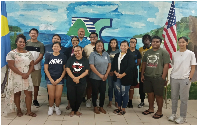
Minister Tmetuchl with his team and PCC students.