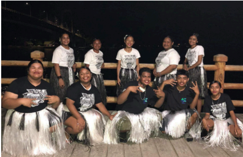
PCC CTE Lab School dancers @ the Night Market

The Career Technical Education (CTE) Lab School students gave a stunning live dance performance at the recent Night Market at JP Friendship Bridge, Airai last Saturday. The talented group captivated the audience with their lively and funny performance that they debuted at the PCC Mesekiu International Night last month. The performance was met with high praise. We are incredibly proud of our students for representing our college at the national stage and being part of the Palau Visitors Authority's (PVA) popular Night Market program.