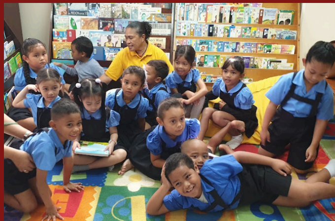
Emmaus Gospel Kinder visits PCC