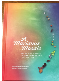
A Marianas Mosaic