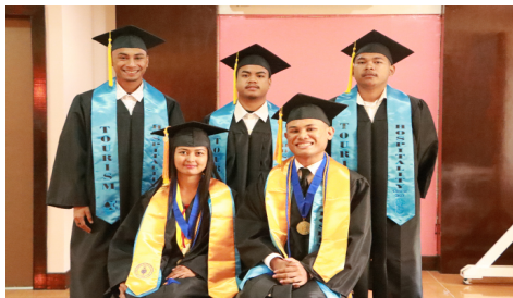
Tourism & Hospitality