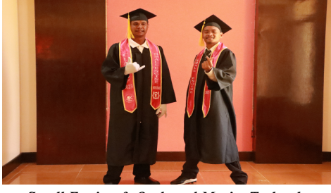
Small Engine & Outboard Marine Technology