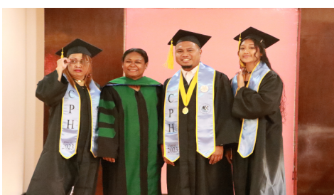
Community & Public Health