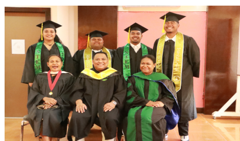
Environmental/Marine Science & STEM