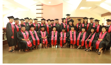
SDSU Masters Program