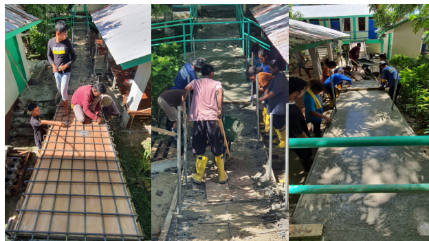
On Friday, July 14, 2023 CTE Lab School Students and Mabuchi workers paved the ramp between Batches bldg. and Accreditation Office