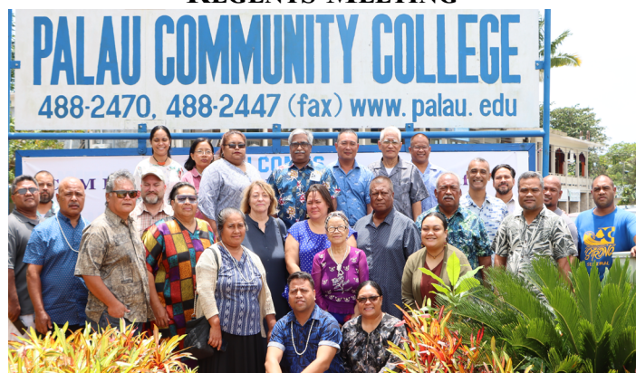
COM Land Grant Board of Regents and administrators, researchers, and extension agents

On August 20-22, Palau Community College hosted College of Micronesia (COM) Land Grant Board of Regents (BOR) and three national colleges Presidents meeting at PCC Assembly Hall. Also present were researchers and extension agents from COM-FSM states, College of the Marshall Islands, and Palau Community College.