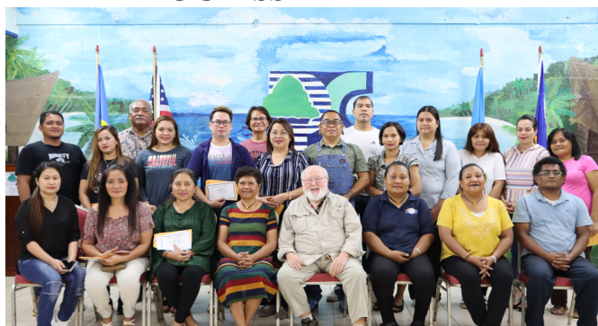
2023 Caregiver Training Cohort 1 awarding ceremony at PCC Assembly Hall

On Monday, August 14, 2023 Palau Community College Continuing Education (CE) in collaboration with Ministry of Health and Human Services (MHHS) and Palau Area Health Education Center (AHEC) began a one-week training for local caregivers at PCC Continuing Education. The focus of the training is to provide information on the concept of aging and general principles of caring for the aged adult.