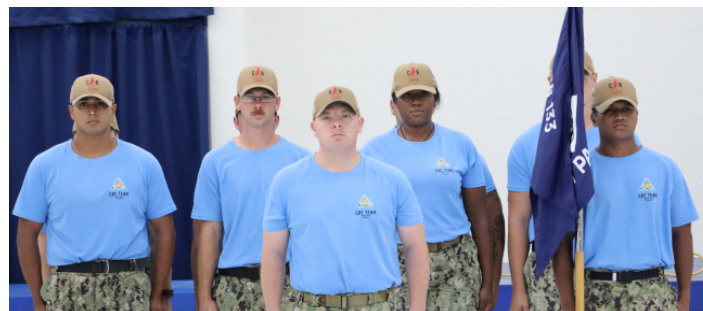
U.S. Navy 133-31