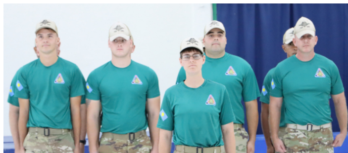
U.S. Airforce 36-06