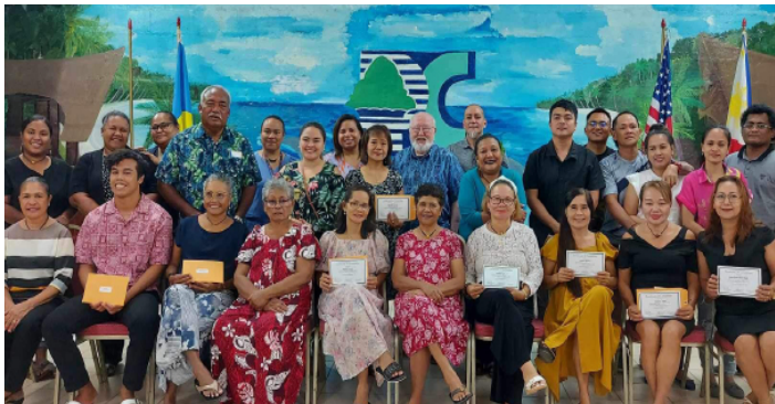
2023 Caregiver Training Cohort 2 awarding ceremony at PCC Assembly Hall

On August 25 and September 1, 2023, Palau Community College hosted two caregiver training awarding ceremony at PCC Assembly Hall. These training were made possible through the collaboration between PCC Continuing Education (CE), Ministry of Health and Human Services (MHHS) and Palau Area Health Education Center (AHEC).