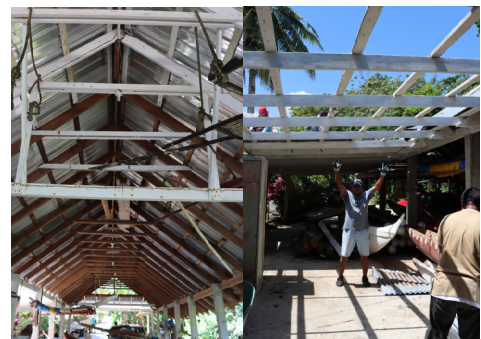
PCC Canoe House at Idederrach: ongoing roof replacement