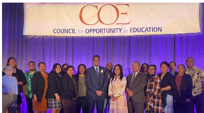
His Excellency Surangel Whipps, Jr., First Lady and PCC Staff at COE.

From September 10-13, 2023 Palau Community College TRiO programs: Upward Bound Classic, Upward Bound Math & Science, Educational Talent Search, and Asian American & Native American Pacific Islander-Serving Institutions (AANAPISI) staff attended Council for Opportunity in Education in Washington D.C. The annual conference is gathering of all TRiO programs in U.S. and its territories including Freely Associated States in Micronesia including Palau to provide needed educational training, resources, and best practices to serve under-represented, low income, and first generation students.