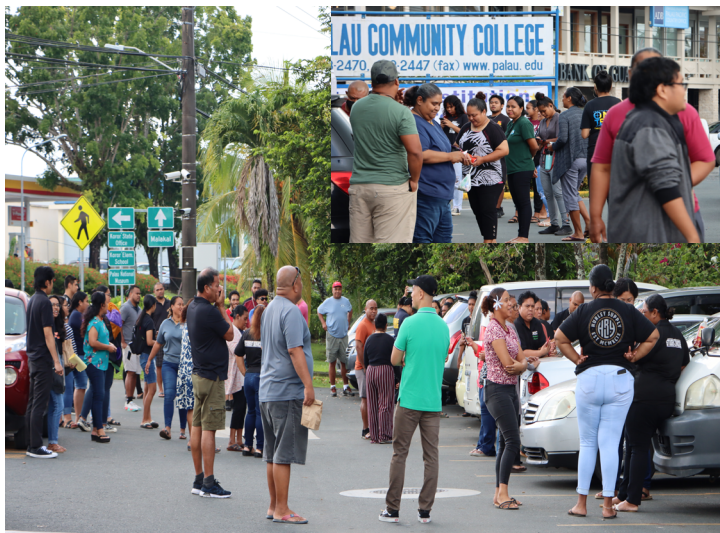
Students, staff, and PCC guests participating in the fire drill

On October 18, 2023 at 10:40 a.m., Palau Community College initiated a campus-wide emergency fire drill to all students, staff and PCC guests. PCC Board of Trustees policy 18-01 established Campus Emergency and Security Committee to develop emergency procedures and conduct emergency drill, activity, and management training to prepare and protect everyone within PCC campus. The college Campus Emergency and Security Committee(CESC) made an announcement, however did not say when, in anticipation of everyone's cooperation in emergency situations. The committee gave out evaluations after the drill and will use those feedbacks to assist in the review, update, and recommend any changes to Emergency Operation Plan (EOP) for the PCC President's review and approval. The college EOP contains emergency procedures and response to any emergency arising from Medical to Active Shooter/Terroristic Acts. PCC thanks the Campus Emergency and Security Committee(CESC) for organizing and thanks everyone who participated in the drill. It is always safe to be prepared.