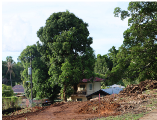
Location of new Academic and Health Science Building between PCC Library and Track & Field

Interested in Learning Transferable Media and Marketing skills? Volunteer with the PCC Development Office. Stop by at the Dort building to sign-up.