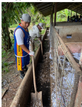
Students of Koror Elementary School joining in on the activities led by CRE staff at R&D Station at Ngermeksang, Ngeremlengui

On October 18 and 19, a total of 82 eighth grade students from Koror Elementary School had a field trip to the Research and Development (R&D) station in Ngermeksang, Ngeremlengui. The students were split into groups and got to rotate in six (6) different stations with activities that included: mixing soil, potting and planting, nursery education, tissue culture, dry litter systems, and collecting dry litter. Each station had an assigned CRE staff to explain the importance of each activity. After lunch, the students were quizzed on what they learned and won stickers. They also were able to share one new thing they learned. Their last activity included a new game called “Plants vs. Threats” that was created by Youth Extension Agent, Elchhung Hideyos. In this game, you basically need to grow your garden with the plant cards and add booster cards that could strengthen your garden or even protect your plants from dying. But there are also threat cards that could kill your plants or destroy your whole garden. This game helped the students understand the many different threats to plants, and also solutions to protect your plants. This newly developed game is still in its trial-and-error phase, but the awesome feedback we got from the 8th graders is that we need to publish the game now! Thank you to our CRE staff and Associate Professor of Agricultural Science, Fredrick Ikertang for teaching.