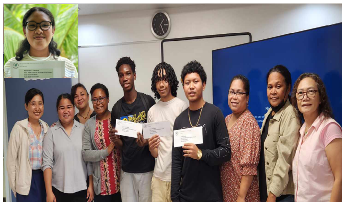
FSA members and FSA scholarship recipients