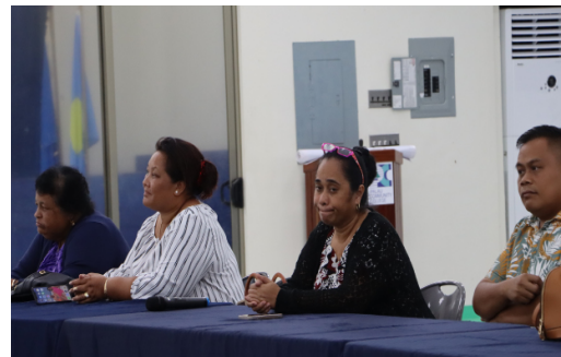
FSM leaders that came to the Mechesil Belau came to PCC Cafeteria to visit FSM students attending PCC