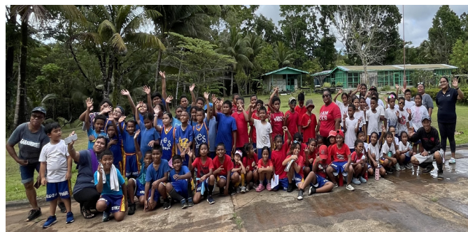
Koror Elementary School 3 rd Graders at R&D Station

On November 2, 2023, a total of 77 third graders visited the Research and Development Station at Ngermeskang. This field trip consisted of a tour of the gardens and farms, mixing soil station, dry litter system area, and the nursery. Following the school's science curriculum (learning about soil), they were able to learn the importance of mixing soil and compost in addition to the many different plants that are grown for food. The students were also given an activity booklet to color and learn about farming. The CRE staff at R&D station would like to thank the little students for visiting and being excited about agriculture!